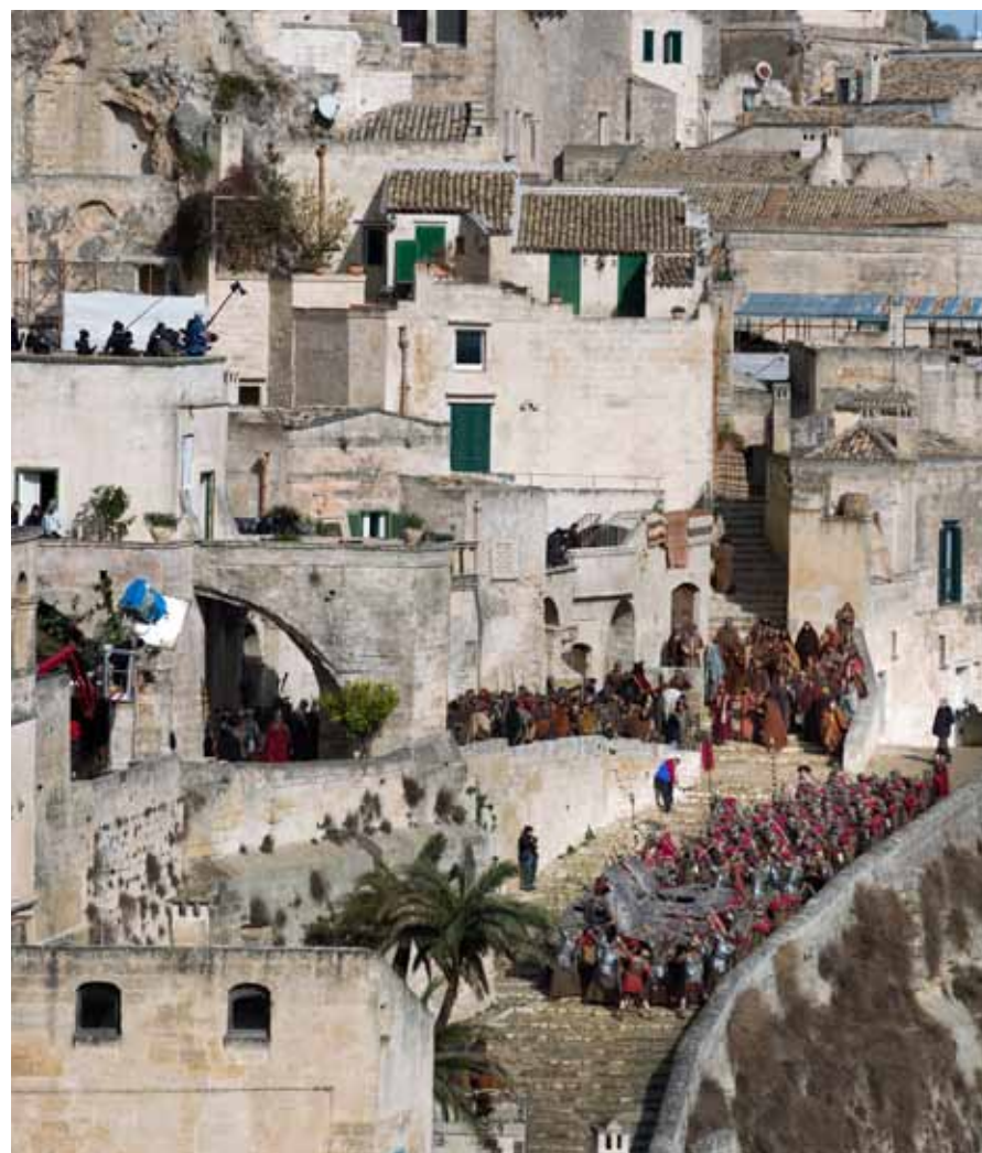
REVIVAL: Extras on the set of Ben-Hur in Matera, 2015